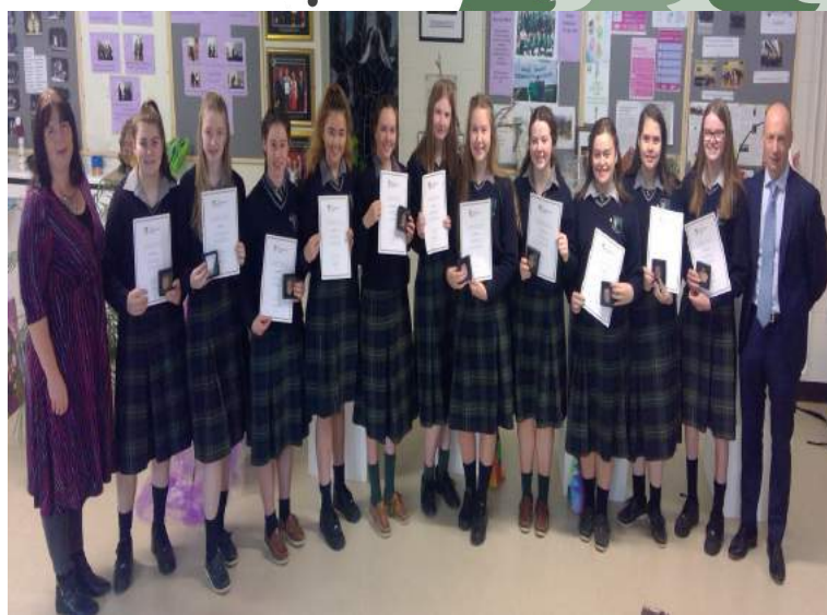
Gaisce Awards for 5th yr. students